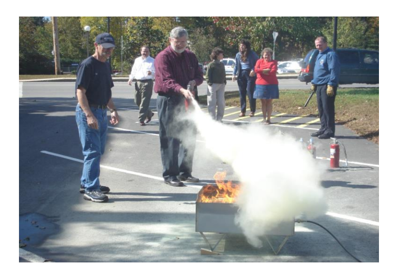
Fire Safety Training

Fire extinguishers are found in every residence. These are your first line of defense in case of a fire and could save your life or the lives of your friends. DO NOT TAMPER WITH FIRE EXTINGUISHERS. Eviction from the residence is a possible consequence for tampering with a fire extinguisher. There is a $100 charge for replacing a fire extinguisher that has been misused.