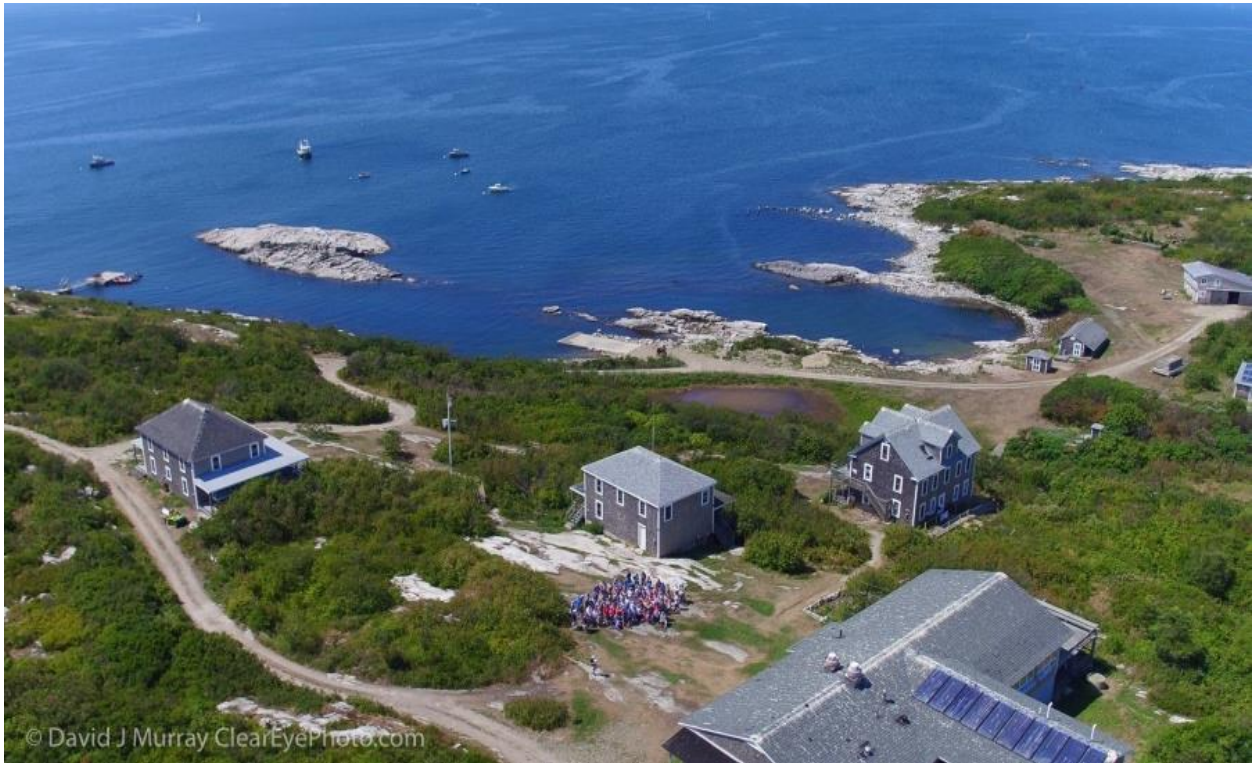
UNH's Appledore Island (isle of shoals classroom)