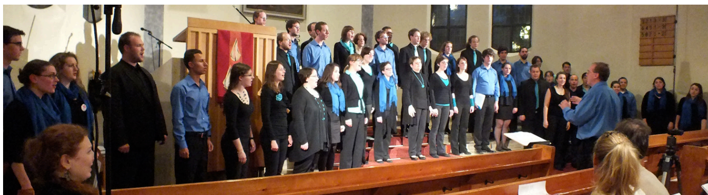
Performing Frühlingsblick with EXtraCHord