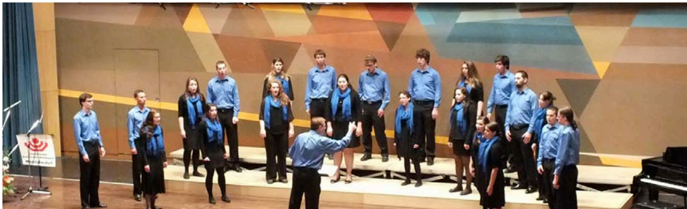
Chamber Singers competing in Marktoberdorf Competition