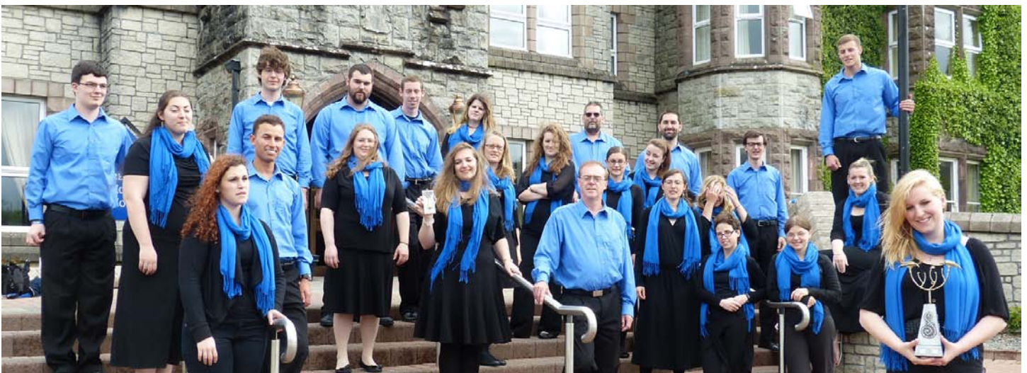
On the steps of Breaffy House, just outside of Castlebar, Ireland

After the completion of the competition, the UNH group travelled north to Sligo, where they gave a full concert program for the benefit of the Organ Restoration Fund at the Sligo Cathedral.