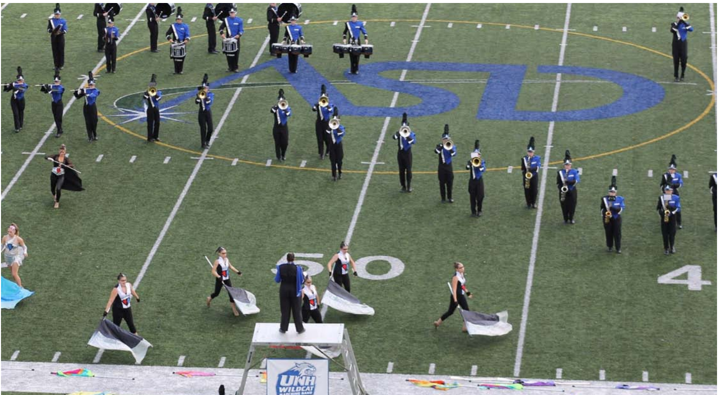
The Collegiate Marching Band Festival at J. Birney Crum Stadium in Allentown, PA.