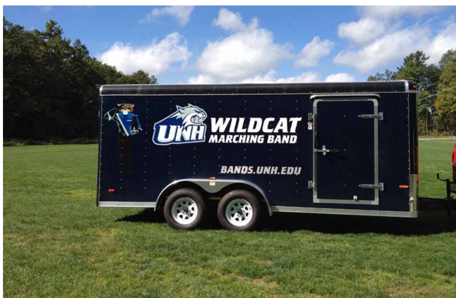
New WMB equipment trailer!

Calling all WMB alumni! The band is gearing up for a 95th anniversary celebration in 2015 and then a 100th anniversary gala in 2019. We have recently moved over to a new mailing list system. In order to