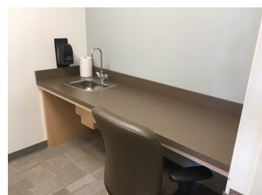
10 West Edge Drive