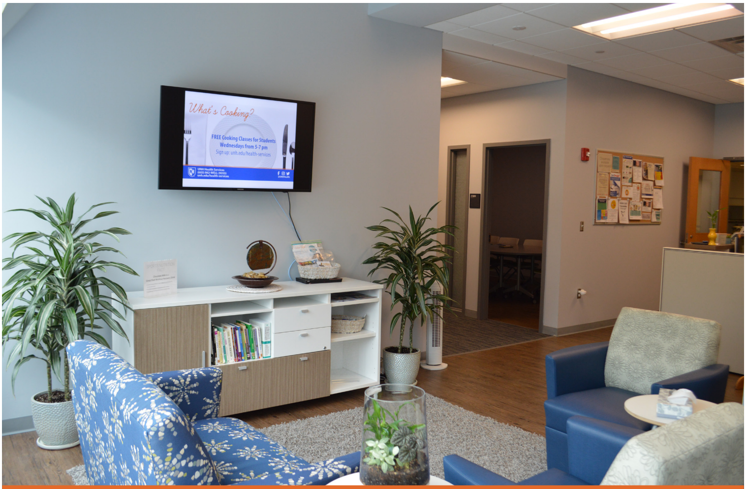
Pictured above: Thrive, Health & Wellness satellite location in the UNH Hamel Recreation Center