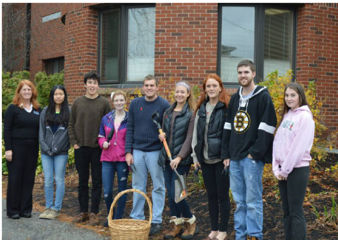
Health Services dedicates Promise Garden. Each year UNH participates in this campaign by planting tulip bulbs in the "Promise Garden" outside of HS.