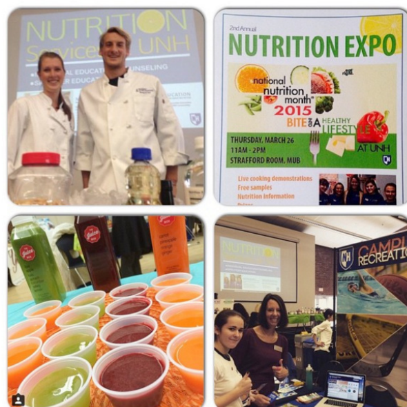
The Second Annual Nutrition Expo—was held in March. On and off-campus groups were on hand to share information with the UNH community. In its second year, the Expo had over 450 people and 30 groups attend.