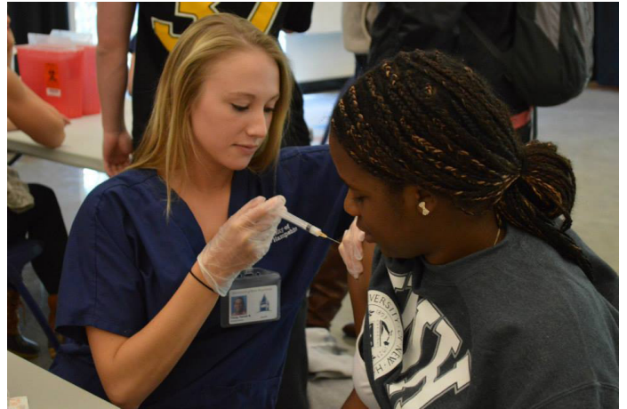
Students from the UNH Nursing Program helped with implementation of the student flu clinic, including providing vaccines to their peers.