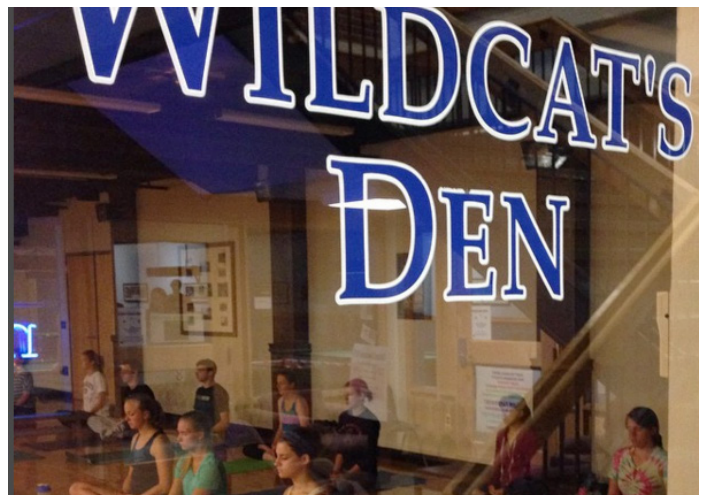
Our weekly yoga classes continue to be a very popular source for students seeking wellness opportunities on campus.