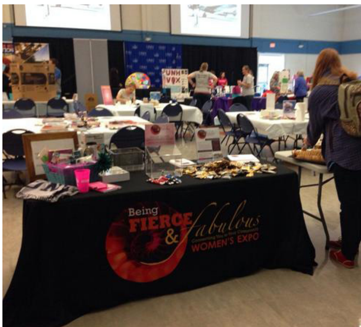
The fourth annual Fierce and Fabulous Expo was held in the Granite State Room. Over 300 students, faculty and staff attended to learn more about campus and community.