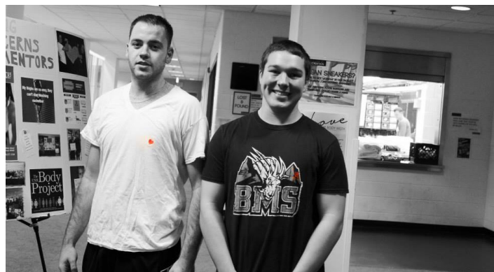
As part of Love Your Body Week, students stopped by Campus Recreation to take part in our "Heart Your Parts" photo shoot. They put a heart shaped sticker on their favorite body part. Sponsored by the Eating Concerns Mentors.