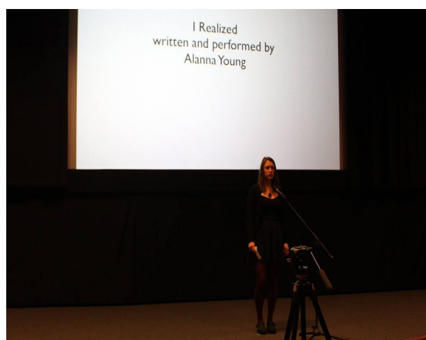
Body Monologues—Live student performance around the struggles with body image and eating disorders—usually end with stories of resiliency. Grew from 99 in attendance in 2013 to over 200 in 2014.