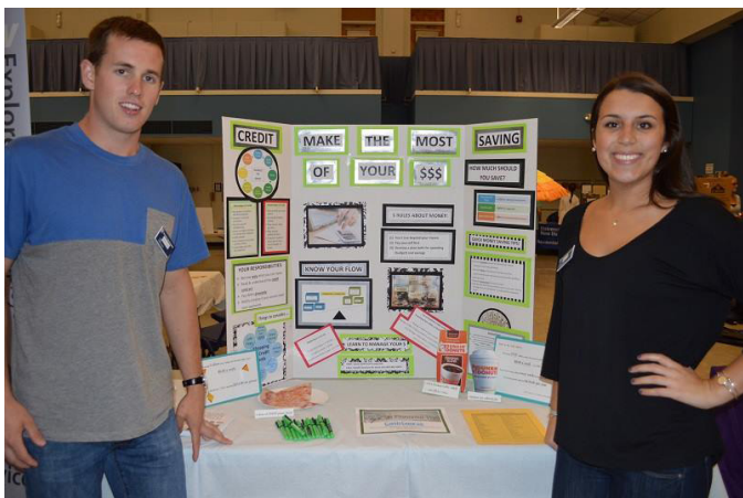
Our Interns enable us to provide valuable information on campus. CashCourse - Are you on the right financial path?