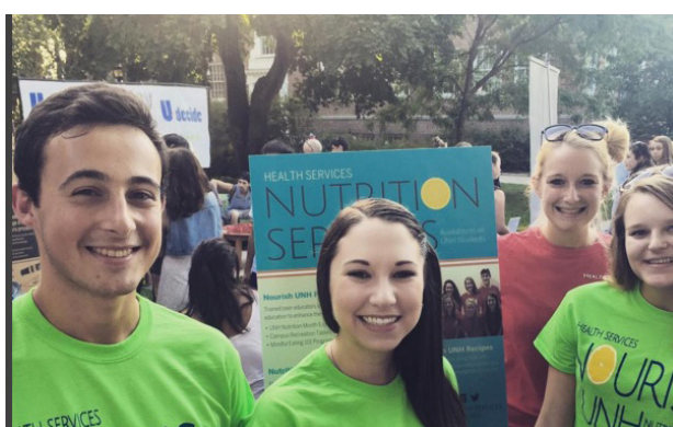
University Day is a great day to catch Wildcat Pride and learn about all the services on campus, including the services and opportunities we provide for student to get involved.