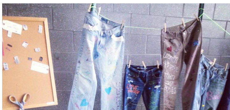
The "Love the Jeans You're In" exhibit on display at UNH Campus Recreation. Gather educational materials and leave feeling empowered. Brought to you by the Eating Concerns Mentors (#unhecm), a UNH Health Services peer education group.