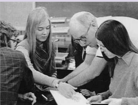
Occupational Therapy students learn how to intervene therapeutically in people's lives to restore and revitalize occupational functioning. Foundation in the biological sciences as well as occupational theory and practice is suited to an active learning style. Cooperative group work, learning through experience and by solving problems are the primary learning modes. Students gain experience working with people in the community and in various other settings.