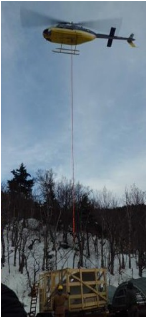
Liftoff of the new microwave dish

N ovember marked the commencement of construction for the NH SafeNet public safety microwave network. Mount Kearsarge is the first of 21 mountaintops to be re-engineered into a consolidated microwave network. The vendor managing the technical design and construction of the network is Green Mountain Communications of Pembroke NH.