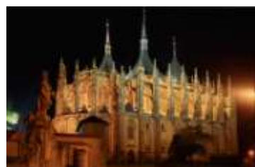
Cathedral of St. Barbara

Along with Antonín Dvořák, Bohuslav Martinů is the most revered composer in his native land, now known as the Czech Republic. Little wonder, therefore, that a competition bearing the composer's name draws the best choirs in the country, as well as from abroad, to the town of Pardubice for the International Bohuslav Martinů Festival and Choir Competition.