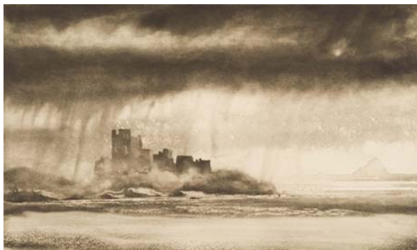
Norman Ackroyd, From Farne Islands , 2005, etching (16/90), 7 5/8" x 12 1/2", Private Collection

Editors: Images available for downloading from Painting with Acid: The Prints of Norman Ackroyd, R.A. , include: