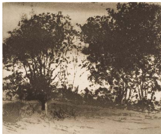
Norman Ackroyd, Daybreak near St Kenelms , 1990, etching (7/45), 5 1/8" x 6 1/8", Private Collection

http://www.unh.edu/art-gallery/images/Ackroyd/Norman_Ackroyd_From_Farne_Islands.JPG