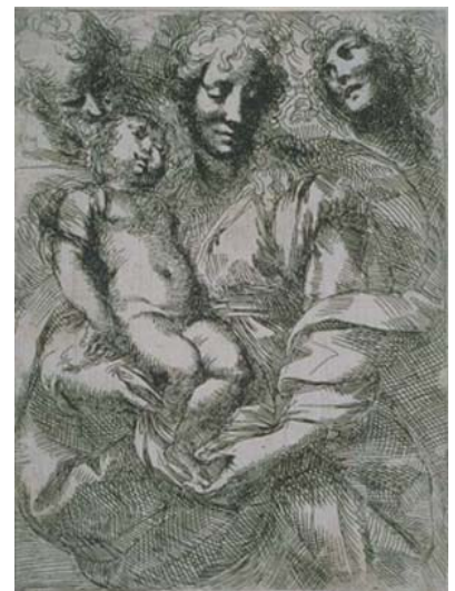
Giulio Cesare Procaccini, Holy Family with an Angel , c. 1600, etching, 162 x 122 mm, Davis Museum and Cultural Center, Wellesley College, Wellesley, MA, Museum purchase

http://www.unh.edu/art-gallery/images/Simple_Art/Anonymous_Knot_Pattern.JPG