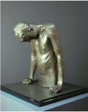
Lewis Cohen, Soliloquy , 2006, bronze, 19" x 14.75" x 15"

http://www.unh.edu/art-gallery/images/Lewis_Cohen/Lewis_Cohen_Self_Portrait_2003.JPG