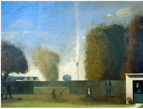
Craig Hood, Firewood , 2005, oil on canvas, 30'' x 40'' http://www.unh.edu/art-gallery/images/Faculty show 2006/Craig_Hood_Firewood_2005_oil_canvas_30_x_40.jpg