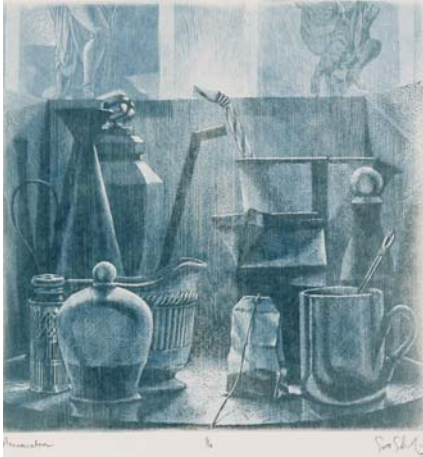
Scott Schnepf, Annunciation , 2006, reduction woodcut, 12'' x 12'' http://www.unh.edu/art-gallery/images/Faculty show 2006/Scott_Schnepf_Annunciation.JPG

Editors: Images available for downloading from Lewis Cohen: Five Decades, Drawings and Sculptures: A Retrospective 1951-2006 include: