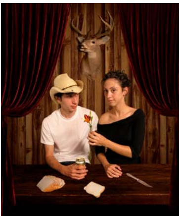
Julee Holcombe, Feast of the Newlyweds , 2005, Chromogenic print, 25” x 21” http://www.unh.edu/art-gallery/images/Faculty_show_2006/Julee_Holcombe_Feast_of_the_Newlyweds.JPG

Editors: Images available for downloading from Art Faculty Review: Julee Holcombe, Craig Hood, and Scott Schnepf include: