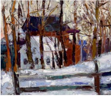
Kathi Smith, "Silhouettes," 2008, oil on panel, 12" x 14"

http://www.unh.edu/art-gallery/images/MFA_II_2008/Erik_Johnson_Ladders.jpg