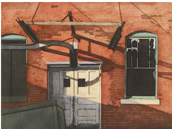
Sidney Hurwitz, Abandoned Factory , 1982, watercolor & aquatint, 18 ¾" x 24 ½"

http://www.unh.edu/art-gallery/images/Sidney_Hurwitz/Abandoned_Factory.jpg