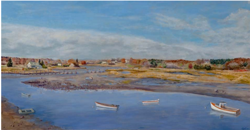
Elyot Henderson, Cape Neddick River , 1967, oil on canvas, 36 1/4" x 60", Gift of Sydney E. Henderson, Collection of the Museum of Art, UNH, 2009.1

Selected images from What's New? Recent Additions to the Collection include: