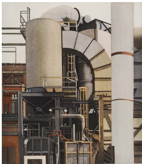
Sidney Hurwitz, Bethlehem III , 1997, watercolor & aquatint, 18 7/8" x 16 1/2"

Selected images from Sidney Hurwitz: Five Decades include: