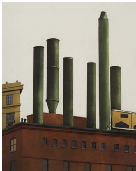
Sidney Hurwitz, Sextet , 1995, watercolor & aquatint, 23 1/2 " x 18 1/2"

http://www.unh.edu/art-gallery/images/Sidney_Hurwitz/Bethlehem.jpg