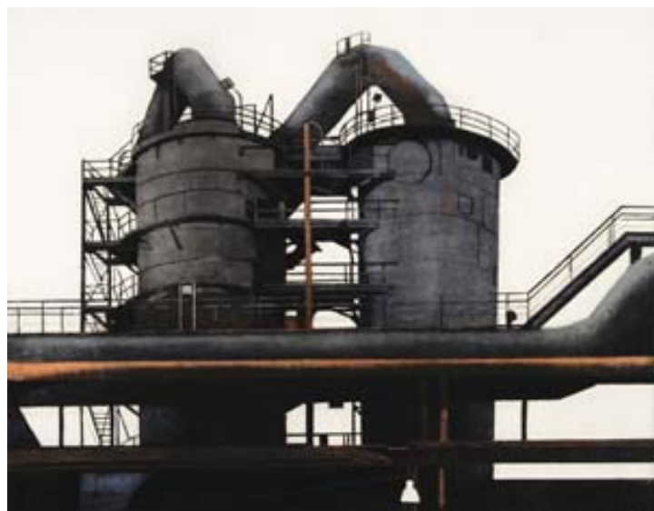
Sidney Hurwitz, Duisburg-Thyssen I , 2002, watercolor & aquatint, 16 7/8" x 20 ¾"

http://www.unh.edu/art-gallery/images/Sidney_Hurwitz/Abandoned_Factory.jpg