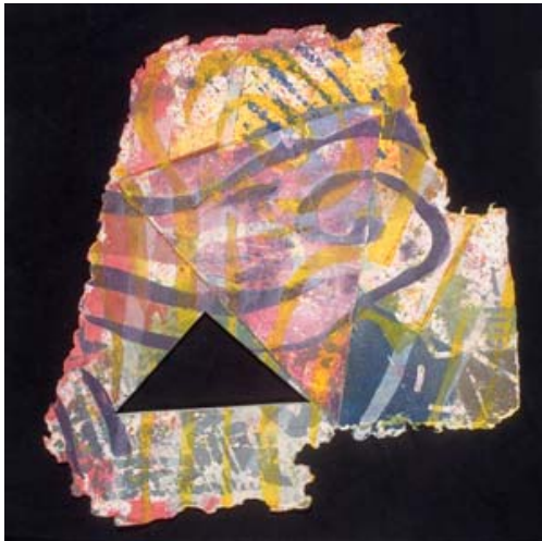
Sam Gilliam, Cool Zebras 16 , 1997, woodcut, relief print, and paint on handmade paper (16/23), 12 1/2" x 12 1/2", Purchased through the Edmund G. Miller Art Collection Fund, Collection of the Museum of Art, UNH, 2008.8

http://www.unh.edu/art-gallery/images/What s New 2009/Elyot Henderson.jpg