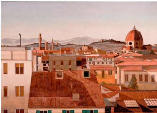
Gabriel Laderman, “View of Florence”, 1962-63, oil on canvas, 49 ¾” x 70”, collection of the artist

Editors: The following high-resolution images of works in the “Gabriel Laderman: Unconventional Realist” are among those available for downloading: