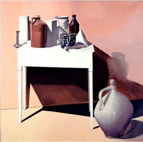
Gabriel Laderman, "Still Life with Large Ceramic Jug", 1972, oil on canvas, 40' x 40", Innes Collection http://www.unh.edu/art-

gallery/images/Gabriel_Laderman/Gabriel_Laderman_Still_Life_with_Large_Ceramic_Jug.jpg