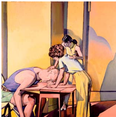
Gabriel Laderman, “This Happens”, 1997-97, oil on canvas, 72” x 72”, collection of the artist

http://www.unh.edu/art-gallery/images/Gabriel_Laderman/Gabriel_Laderman_View_of_Florence.jpg