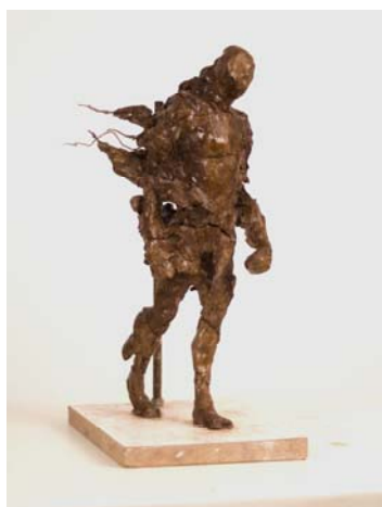
Bob Jones, Walking Man I , 2009, clay on aluminum, 16.5" x 7.5" x 10"

Selected images from the 2009 Senior B.A. and B.F.A. Exhibition include: