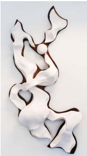
Jameson Davis Copp, Aeolian Process , terra sigliata, 2009, 5' x 3'

http://www.unh.edu/art-gallery/images/BA_BFA_2009/Amber_Tozzie.jpg