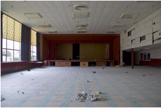
Ryan Howell, Cafetorium , 2008, inkjet print, 16" x 24" http://www.unh.edu/art-gallery/images/BA_BFA_2009/Ryan_Howell.jpg