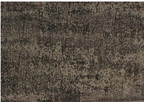
Kelsey Keenan, Half a Day (detail), 2008, acrylic on canvas, 5' x 7'

http://www.unh.edu/art-gallery/images/BA_BFA_2009/Kelsey_Keenan.jpg