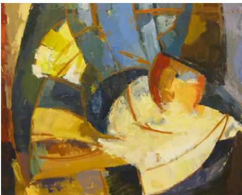
Christopher Dolan, Durham Tabletop #3 , 2008, oil on canvas http://www.unh.edu/art-gallery/images/MFA_I_2009/Christopher_Dolan_Durham_Tabletop.jpg