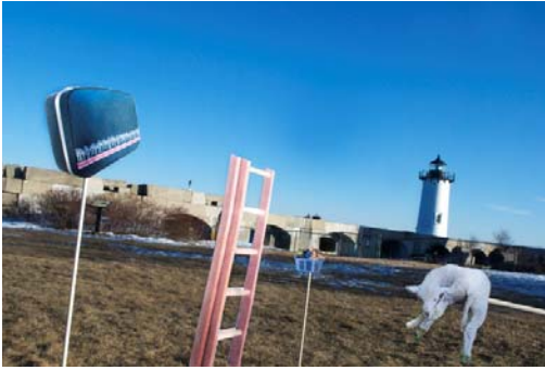
Jessica Engel, Lexicon , 2009, digital photograph, 20" x 30" http://www.unh.edu/art-gallery/images/BA_BFA_2009/Jessica_Engel_Lexicon.jpg