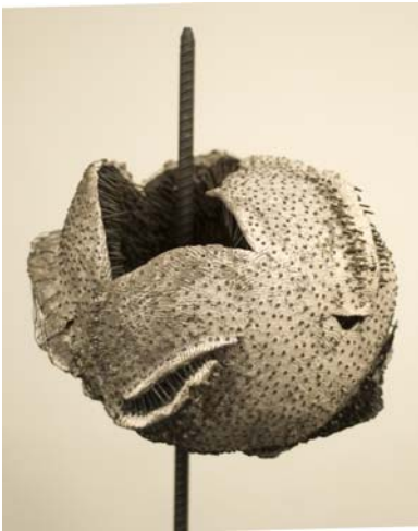
Maura L. Carignan, 7 Bowls Impaled , 2008, mixed media, 6' x 2' http://www.unh.edu/art-gallery/images/BA_BFA_2009/Maura_L_Carignan.jpg