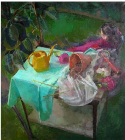
Gregory Poulin, In the Garden , 2009, oil on linen http://www.unh.edu/art-gallery/images/MFA_I_2009/Gregory_Poulin_In_the_Garden.jpg