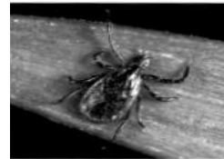
Black-Legged Tick ("Deer Tick")