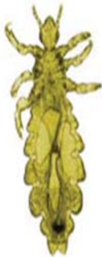
An adult head louse.