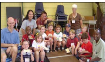
Faculty and students bring cutting edge knowledge to NH public schools

The Engaged Scholars Academy (ESA) and the Research and Engagement Academy are semester-long faculty development programs designed to advance the scholarship of faculty across a range of disciplines. Faculty in the ESA learn best practices in engaged scholarship as they participate in a series of workshops and teams, interact with faculty experts, enjoy interdisciplinary discourse and capitalize on mentoring opportunities. The R&E Academy faculty also commit to submit proposals for external funding and learn about funding opportunities to advance scholarship and partnerships. To date 10% of the UNH faculty have completed the ESA and 34 faculty are in the inaugural Research & Engagement Academy.