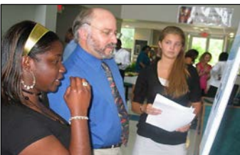
A faculty member and students discussing research at the URC

The Office of the Senior Vice Provost for Engagement and Academic Outreach supports the development of mutually beneficial partnerships with external collaborators by catalyzing and supporting faculty (interdisciplinary teams and individuals) that enhance student learning, increase success with external funding, support faculty development, and reach beyond the University’s walls. Excellence through external partnerships is central to the University of New Hampshire’s success and engagement across the state, the nation and globally. We will engage and provide ongoing support to faculty who challenge their students, collaborate with external partners, advance inclusive excellence and who ultimately seek to make a difference in the larger society.