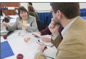
Faculty and external partners developing an innovative proposal to the National Science Foundation

The Undergraduate Research Conference (URC) is the highlight of each spring semester—a celebration of the academic success of our students. This office is responsible for the URC and for developing partnerships with specific federal agencies in areas of opportunity and mutual benefit for the agency and for the University. We catalyze and support multi-disciplinary proposals responsive to opportunities at federal agencies & foundations currently targeting the National Science Foundation and the National Endowment for the Humanities.